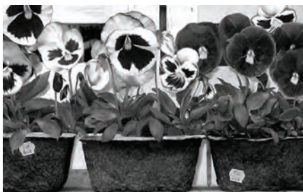
"Flowers for Sale"