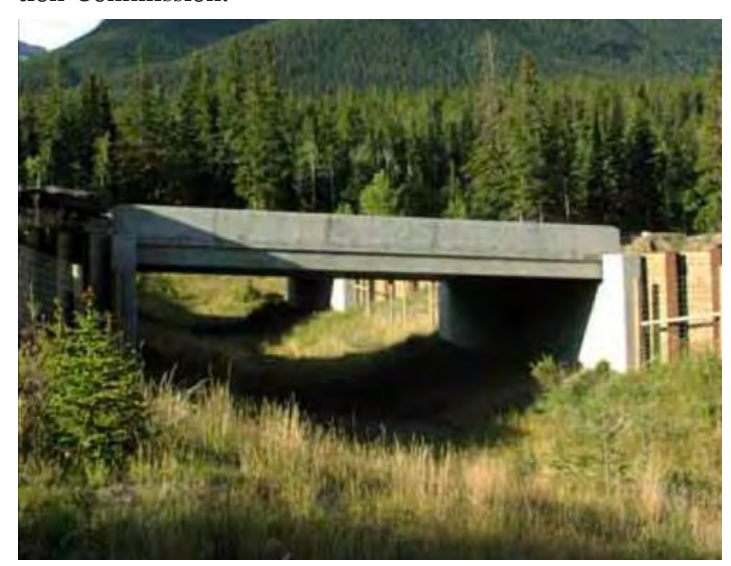
Photo top: Overhead view of the proposed location of the Farrar Farm Wildlife Crossing (shown in yellow); Photo bottom: Example of how the proposed Farrar Farm Wildlife Crossing would look.

This public/private partnership continues through the commitment and cooperation of the following organizations: New Hampshire Department of Transportation, New Hampshire Audubon Society, New Hampshire Fish and Game, the U.S. Forest Service, The Nature Conservancy of New Hampshire, The Conservation Fund, the Northeast Wilderness Trust, the University of New Hampshire, and the Town of Randolph. Other conservation organizations support the project including the National Wildlife Federation, the Staying Connected Initiative, the Quebec-Labrador Foundation, and the Jefferson Conservation Commission.